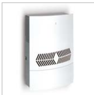
REMKO SLE 20 With condensate container