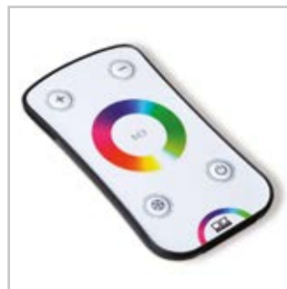
LED RGB remote control