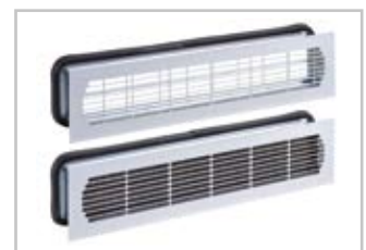
Next-room set 2 SLN