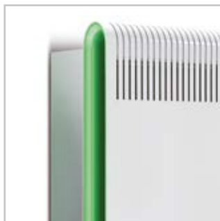
Side section with LED lighting function