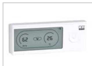
Radio remote control