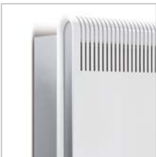
Side section without LED lighting function