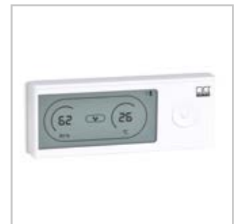
Radio remote control